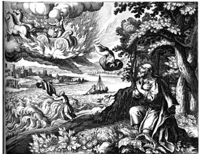
Borrowed Wings and Borrowed Chariots