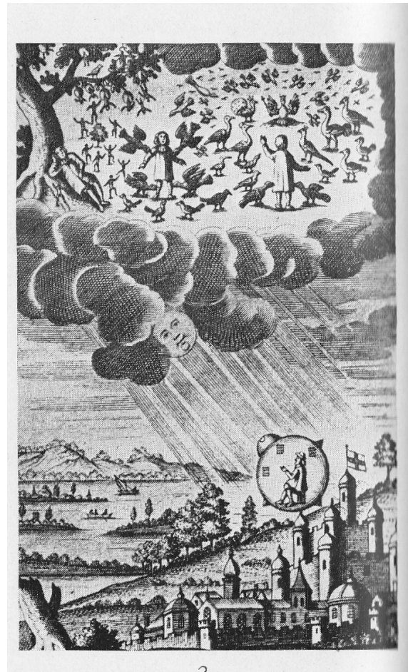
Solar-Powered Flight: Cyrano de Bergerac on his way to the moon (left) and sun (right).

Cyrano de Bergerac is an equal-opportunity thief. His methods of reaching the moon include spring-driven wings, rockets, dew, bone marrow, swimming (at the time of Noah's flood, when the waters were higher), the odor of sanctity, demons, magnets (such as those powering Elijah's chariot), and will power.